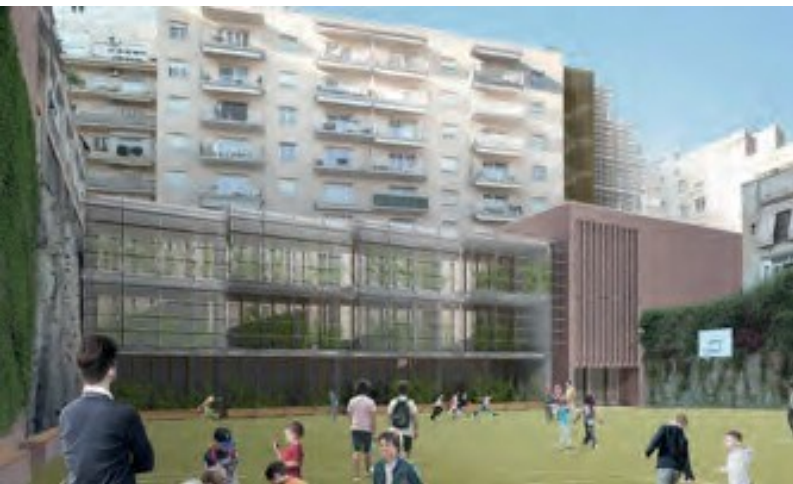
Figure 2. Small building future façade