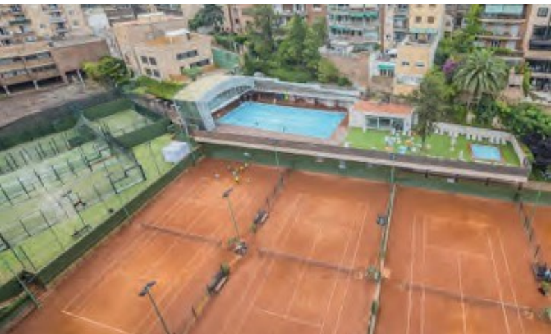
Figure 3. Adjoining sports club facilities