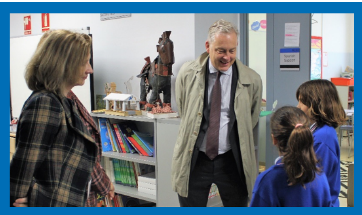
BSB welcomes a special visitor

Congratulations to everyone involved, especially the teachers in the Ecology & Sustainability programmes.