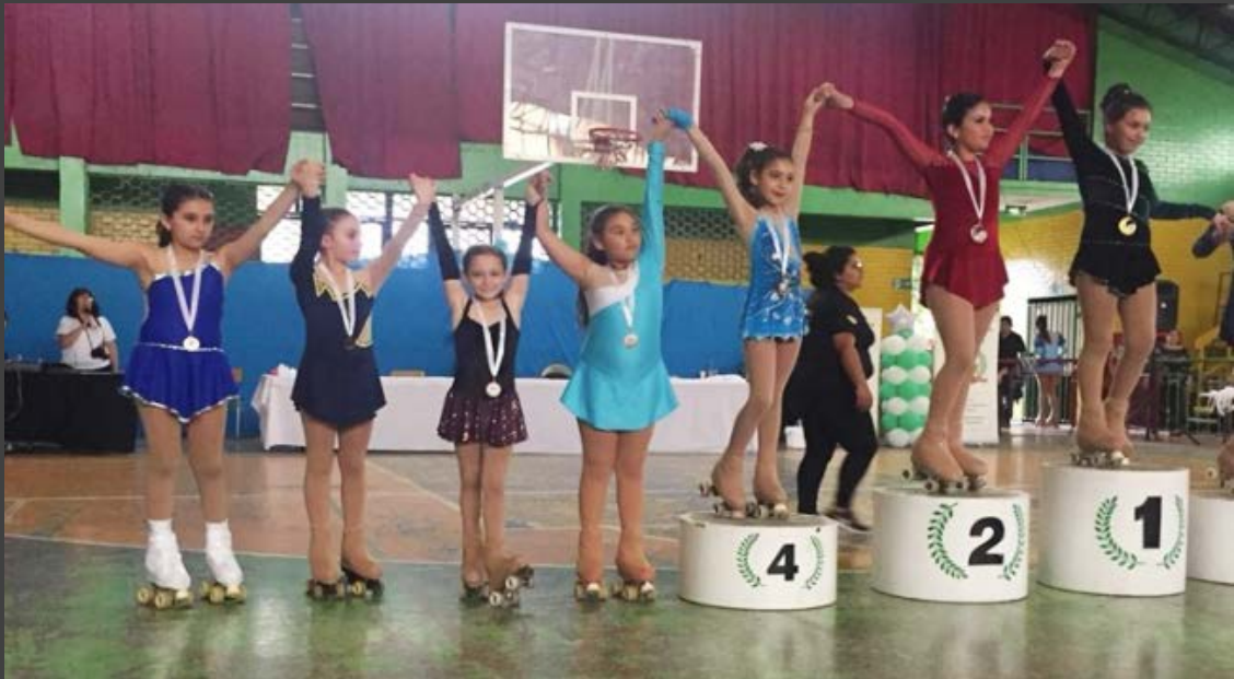
Figure skating success for Santo Tomás

The day was an enormous success and raised awareness of the importance of being life-long learners.