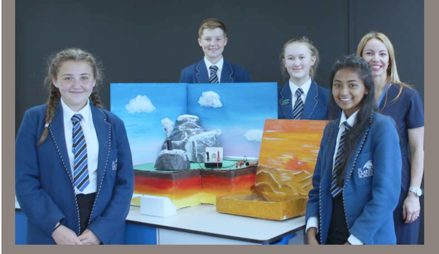
Students showcase their 'Bright Ideas'

Having been crowned Welsh Regional Winners, Year 9 scientists from St Clare's School in the UK competed in the final of Shell's Bright Ideas Challenge 2018.