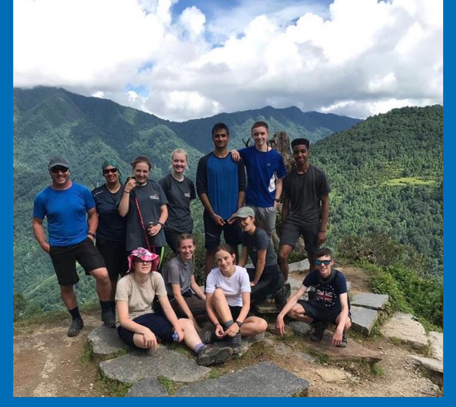
A summer to remember

A group of students from Quinton House School in the UK have spent their summer in Nepal, helping communities in need and having a great adventure.