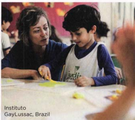
Instituto GayLussac, Brazil