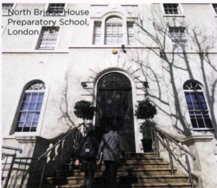
North Bridge House Preparatory School, London

"Secondly, and quite critically, Jacobs has a passionate conviction for education and for the benefits of developing young minds. Together, Jacobs and Cognita share an ambition to help shape the future by educating young minds to think globally, act responsibly and achieve their