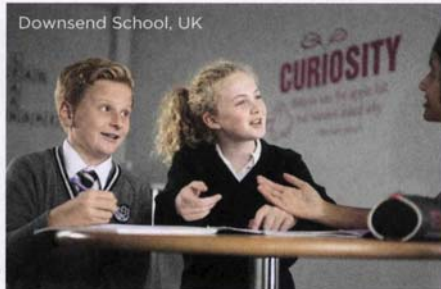
Downsend School, UK